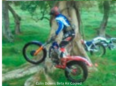
Colin Downs Beta Air Cooled