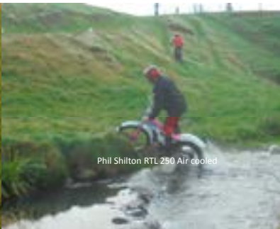
Phil Shilton RTL 250 Air cooled