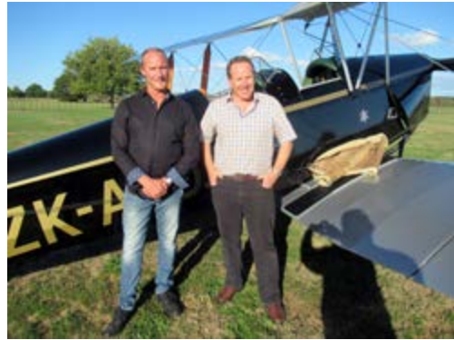
The Tiger Moth show and landing at the Centenary Dinner.