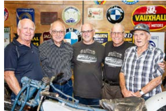
Some crusty old dudes hanging around the show on the last day. Life Members all.