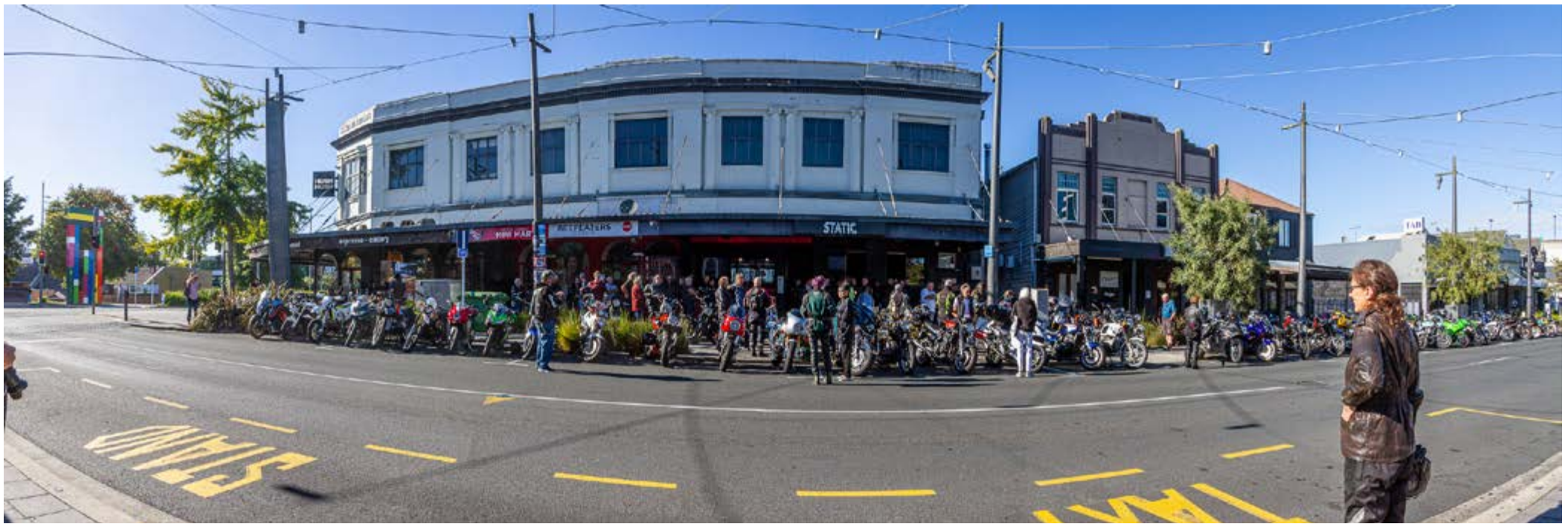
Well over 60 motorcycles and their riders gathered in Hood St for the Cenetnary ride, and most made it to the top of the Kaimai's, re-creating one of the club's original rides.