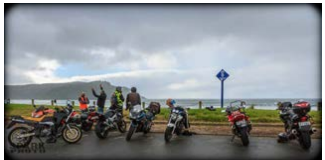
Top Photo 1989