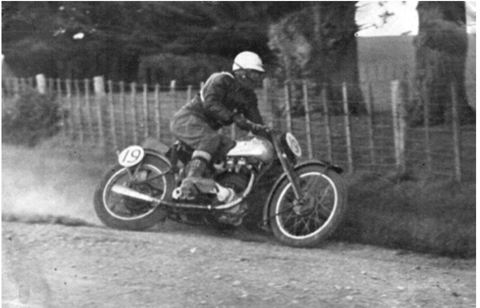
Another as yet unidentified rider, doing the Road Hill Climb, Howden Rd (Gee's Farm)